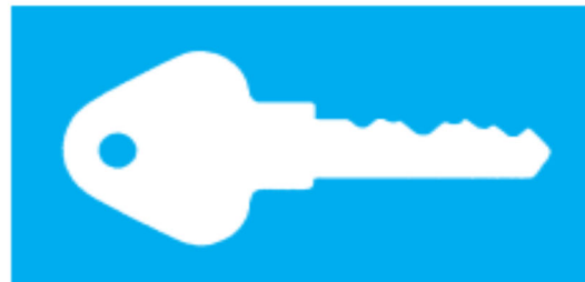
MLAK key symbol

Eligible people will be able to purchase a key that will open all accessible toilets that display the MLAK key symbol below: