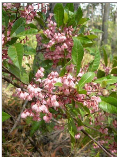
Blueberry Ash ( Elaeocarpus reticulatus )

Backhousia myrtifolia , Grey myrtle, Ironwood Backhousia citriodora , Lemon-scented Myrtle Callicoma serratifolia , Black Wattle Ceratopetalum apetalum , Coachwood Ceratopetalum gummiferum , NSW Christmas Bush Doryanthes excelsa , Giant Lily Gymea Lily Doryphora sassafras , Sassafras Elaeocarpus reticulatus , Blueberry Ash Eucryphia moorei , Eastern Leatherwood, Plumwood Ficus coronata , Sandpaper Fig Ficus rubiginosa , Port Jackson Fig, Rusty Fig Hymenosporum flavum , Native frangipani Myrsine howittiana , Brush Muttonwood Myrsine variabilis , Variable Muttonwood Tristania neriifolia , Water Gum Tristaniopsis collina , Mountain Water Gum, Hill Kanuka Tristaniopsis laurina , Water gum, Kanuka