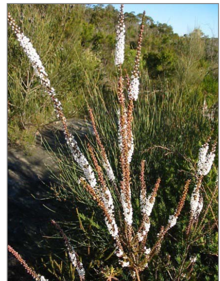
Coral Heath ( Epacris coriacea )

Council’s Landscape Assessment Officer (Tuesday—Friday) Telephone: 4780 5472 Email: council@bmcc.nsw.gov.au