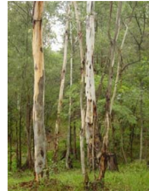
Smooth barked Eucalypts