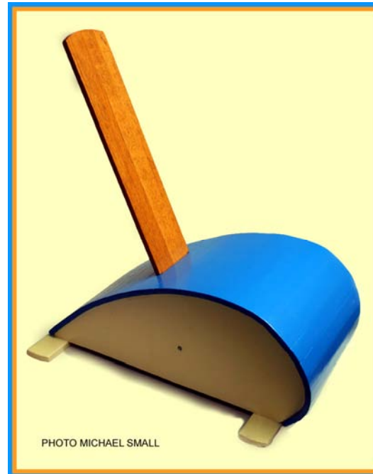
Sun Chair by Martin Errey. Made from salvaged marine ply and oak from a 1930s wardrobe.

Some examples of upcycling are: turning an old wardrobe into a display cabinet, cutting up old sneakers to make stamps from the soles, using old clothing as wrapping 'paper' or turning an old ironing board cover into oven mitts.